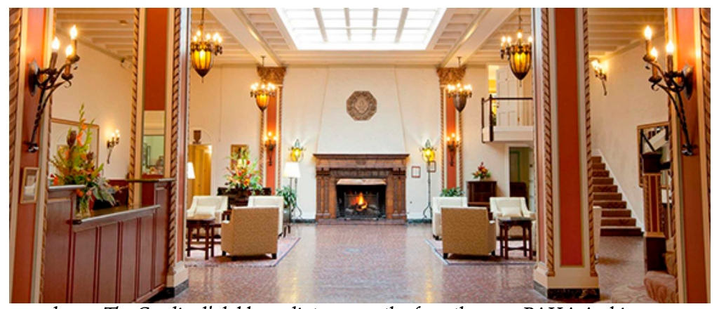
and now. The Cardinal's lobby radiates warmth of another era.

The Cardinal Hotel quickly became a social gathering place in pre-Depression Palo Alto. The 17 piece Cardinal Band played at popular evening suppers and afternoon tea dances. The Hotel offered a dining room, Wilson's at the Cardinal, which could seat seventy-five guests. The menu featured entrées such as liver and bacon for less than 50 cents.