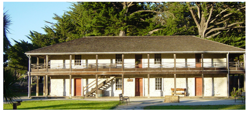
The Sanchez Adobe in Pacifica, one of three well-preserved sites operated by the San Mateo County Historical Society.

The San Mateo Historical Society states its mission, "To inspire wonder and discovery of the cultural and natural history of San Mateo County." It oversees three historical sites: the San Mateo County History Museum in Redwood City, the Woodside Store in Woodside, and the Sanchez Adobe in Pacifica, as well as running school programs at the Folger Stable in Woodside. For information on its events and activities, visit http://www.historysmc.org/. If you haven't visited Sanchez Adobe, plan to do so; you have missed a Bay Area treasure!