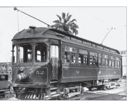
Car 52, which once ran from San Jose to Palo Alto, is part of the Western Railroad Museum's collection in Solano County.

When the volunteer staff at the museum realized why we were there, they gladly adjusted the schedule to feature Number 52 on the first run