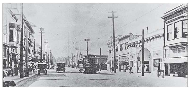
Trolley on University Avenue passing the Varsity Theater and heading towards Stanford campus, c. 1910–1925.

In the past I have discussed some of the fine local history museums that can be visited in the Bay Area. To that list of museums worthy of your interest, I would add the Western Railroad Museum (www.wrm.org). It is a great place for children or grandchildren, but also for those who remember the streetcars and interurbans that ran throughout the Bay Area.