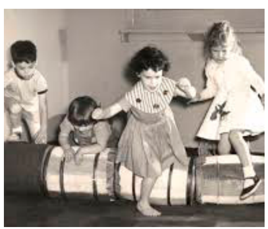
Children at active play in Bing Nursery School, which remains a site for learning about preschool education.

Readers of the Tall Tree will not be surprised to know that preschool education, what we used to call nursery school, is alive and well in Palo Alto and has a distinguished history. A simple Google search leads to a dizzying array of local preschool options: private, cooperative, religious, academically-oriented, play-oriented, foreign language-oriented; each has an informative website and rave reviews from satisfied parents.