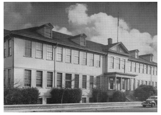
The Wilmerding School of the Industrial Arts in the late 1930s.

Building still exists at the corner of 17th and Potrero, while a UPS facility occupies the original Lick-Wilmerding site.