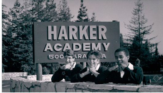
Harker Academy was once upon a time a girls' school, while Castilleja, whose campus is pictured left in a 1930s map, has been educating women since 1907.