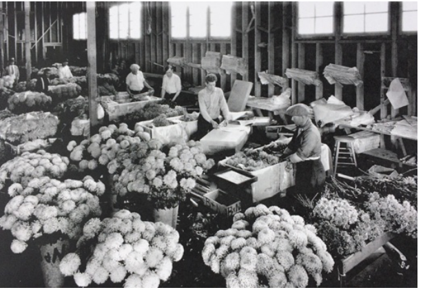
Early chysanthemum packing house. Workers prepare flowers for shipment east and abroad.

With the addition of exports to Asia and Europe, by 1929 Redwood City claimed to be the "Chrysanthemum Capital of the World", helping San Francisco emerge as one of the world's three great flower markets – after London and Chicago, and before Amsterdam. In 1931, the local Japanese-American community held the nation's first Kiku Matsuri, or Japanese Chrysanthemum Festival, showcasing cultural traditions with a parade, concerts, tea ceremonies, dance, and martial arts programs. The flower is esteemed in both Chinese and Japanese cultures as a traditional symbol of long life and rebirth. In Japan, the flower's beautiful alignment of petals, which unfold in a precise manner, represent perfection and nobility and became part of many family seals, including Japan's royal family.