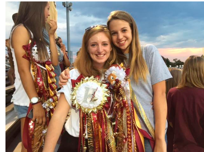
Contemporary Texas football mums, still popular for high school homecoming displays in parts of the country. The displays are personalized and can reflect sports played, favorite hobbies and even boyfriends' names.