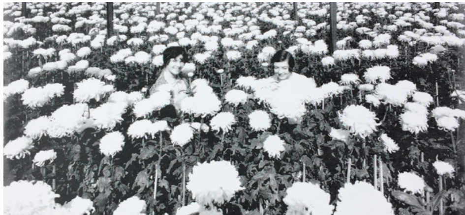
Mums grown under cheesecloth attained greater height and produced larger blooms than field grown ones.