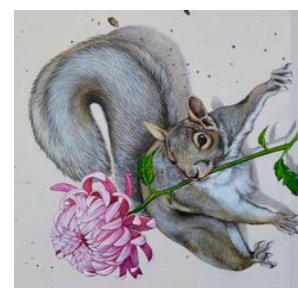
Peninsula floriculture gradually moved southward from San Mateo to Santa Clara County due to the disruption of World War II and increasing real estate prices. Some Japanese and Italian growers settled in Runnymede (modern day East Palo Alto) from the 1930s through the 1950s, pictured above, while Chinese growers, who became more influential after the war, were concentrated around Mountain View. Pressure from cheaper South American imports eventually forced flower growers to abandon the Bay Area for Gilroy and the Monterey Peninsula. By the end of the century most floriculture had left the state. Redwood City commemorated the role of chrysanthemums during its 150th anniversary with a series of wall paintings by artist Jane Kim.