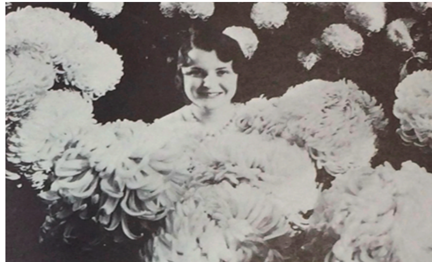
A San Mateo County Fair Queen among prize-winning chrysanthemums in the 1930s.