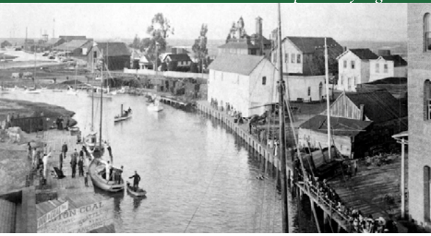
Redwood Creek, first used in 1851 as a channel for the lumber industry and center for shipbuilding, once flowed all the way to downtown Redwood City.

Once you have learned about the 150 year history of Redwood City at the November 5 general meeting, you may want to explore its past more thoroughly. Redwood City's Historical Resources Advisory Committee has made this possible with its online publication of " The Path of History ," an illustrated brochure of suggested self-guided walking tours , complete with maps and thumbnail summaries of the sites along the way such as the San Mateo County Courthouse and the New Sequoia/Fox Theater. The "Path of History" download is available at redwoodcity.org.