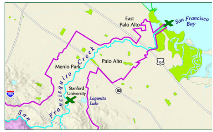
"At Roy Lausten Point, near the Pope St. bridge, the crew disembarked long enough to refresh itself." The crew, listed below, managed to navigate successfully to the San Francsico Bay. Green X's mark the start and finish.

Later in my life, we used to swim in the creek at the same spot in the picture. When the rain had subsided and the water level dropped, it left a perfect swimming hole for some local kids to have a fun day.