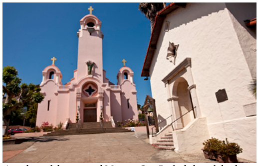
A replica of the original Mission San Rafael chapel, built in 1949, sits to the right of the current Saint Raphael's church.

Mission San Rafael was the last mission established under Spanish rule. Mission San Francisco Solano, in Sonoma, was the final California mission, established when California was part of newly independent Mexico. Following secularization in the 1830s, the Mexican government seized the