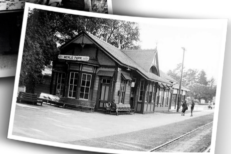
Photos upper left to lower right: the Stanford Quad, 1902; Camp Fremont, 1918; the Hermit of Jasper Ridge and friends, early 1900s; Menlo Park Train Station, 1918.

FREE AND OPEN TO THE PUBLIC * REFRESHMENTS SERVED