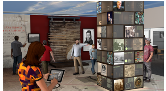
Rendering of the future interior of the Palo Alto History Museum.