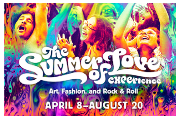
Fifty years on, revisit what you may or may not remember from the Summer of Love.

Hours: Tuesdays, 4-8 pm, Thursdays, 1-5 pm