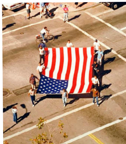
The flag carried through downtown during Palo Alto's 1994 Centennial parade.

On the 4th of July, the City of Palo Alto hosts its 36th annual Chili Cook-Off and Summer Festival , beginning at 12:00 noon at Mitchell Park. For information on how to compete for prizes and to download the entry form, visit www.cityofpaloalto.org/gov/depts/csd/events/chilicookoff.asp . Redwood City is celebrating its 150th Anniversary as a charter city with its annual 4th of July parade. Other featured events include a pancake breakfast, entertainment, and fireworks. For details and more information visit www.parade.org .