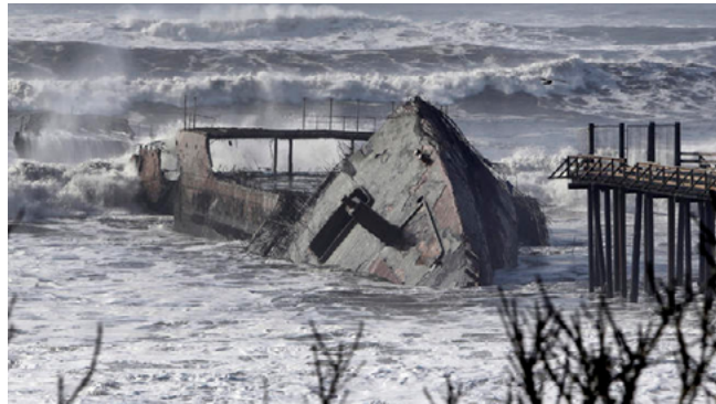
Waves crash into S.S. Palo Alto at Rio Del Mar in Aptos this January, after it was torn apart during a storm.

Bankruptcy of the Seacliff Amusement Company, the Depression, and a heavy storm in 1932 ended the promoters' dreams to add a hotel and residences to the site. The State of California purchased the ship in 1936, stripped her of her amenities, and left her as an extension of the fishing pier. To add insult to injury, she was deemed unsafe and closed to the public in 1950. Despite efforts to rescue the "cement ship," she continued to deteriorate until the winter of 2016-2017.