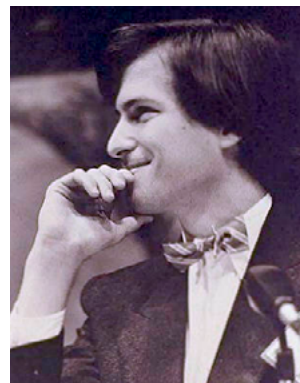
Steve Jobs (1955-2011)

Be it a community of weavers, golfers, artists, professionals, or activists of one form or another, there does seem to be the desire, and perhaps need, to gravitate