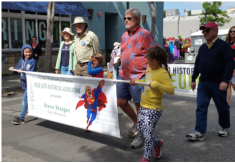
PAHA marchers, including their hero, in the 2017 May Fete Parade.