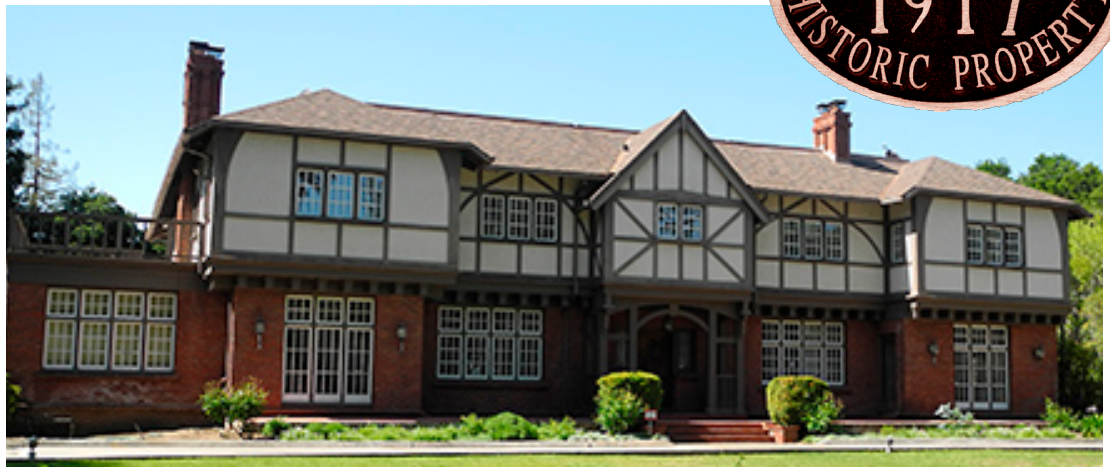
369 Churchill, built in 1917, is one of the one hundred year-old homes receiving a PAST Heritage Centennial Plaque this year.

FREE AND OPEN TO THE PUBLIC * REFRESHMENTS SERVED