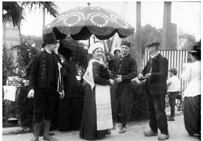
The Belgian Fair in Palo Alto, 1916. These fairs were started in 1915 to raise funds locally to support the Committee for Belgian Relief.

Indeed, the Woman’s Club of Palo Alto quickly responded: their 1914 minutes record that “...this was not the year to think too much of self...” The “ladies of the club” pledged support for Belgian refugees by raising and donating money for the Belgian Relief Fund in 1915 and 1916. The Woman’s Club sponsored the fruit booth at Palo Alto’s Belgian Fair, with proceeds directed to the