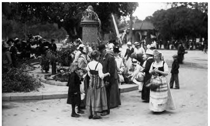
Belgian war relief drive at the Belgian market on the Circle, which preceded the Red Cross Chapter (old train station in the background).