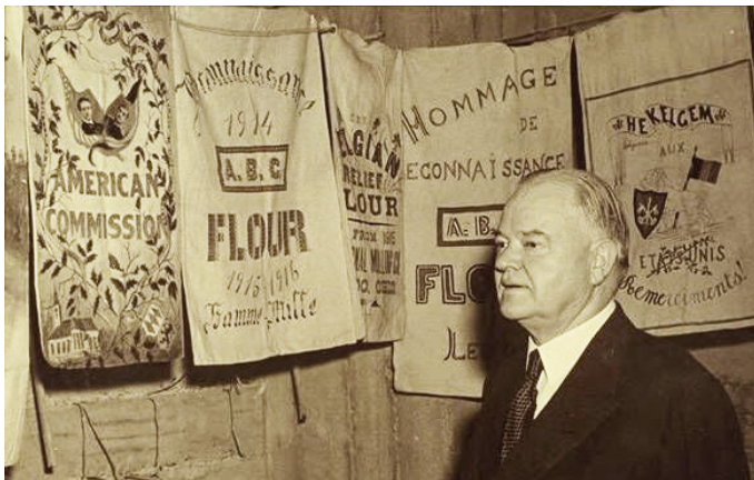
Years later, former President Hoover stands in front of a display of flour sacks used in the Belgian war relief effort, which he started as a successful mining engineer based in London.

THE GREAT WAR ERUPTED IN 1914 AS GERMAN TROOPS MARCHED THROUGH NEUTRAL BELGIUM, HOPING TO CELEBRATE CHRISTMAS IN PARIS.