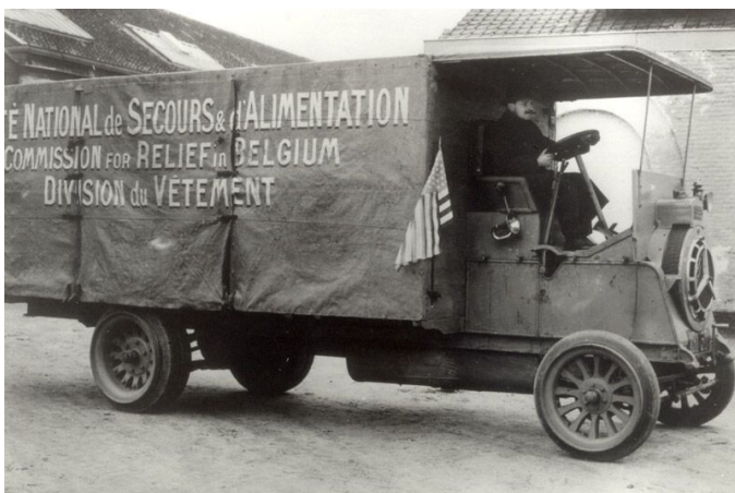
Special trucks and ships were operated by the CRB to distribute rations to more than 2,500 villages and towns.

After the Battle of the Marne, the Allies “dug in,” forming a massive line of trenches opposing a German line that stretched from the English Channel to the Alps. Food supplies dwindled in occupied Belgium where famine stalked the land. News of the “starving Belgians” aroused sympathy in the West. Herbert Hoover and his team of volunteers didn’t anticipate that their humanitarian task of feeding the Belgians or supporting them as refugees would last four years. Hoover secured an appointment to lead the CRB. He later wrote that the CRB had not planned that the program would have “to find a billion dollars, to transport five million tons of concentrated food, to administer rationing,” and act as a novel relief organization.