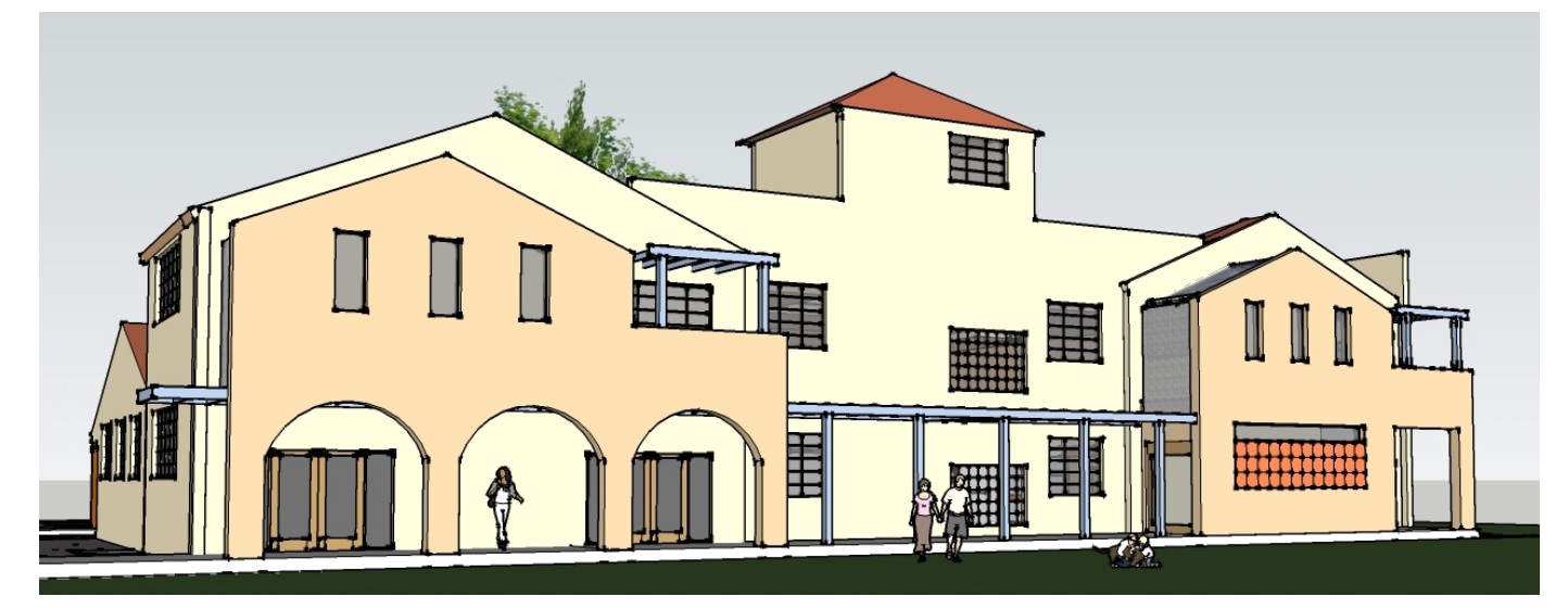
Perspective of the proposed Palo Alto History Museum as viewed from the south. Courtesy Garavaglia Architecture, Inc.

For more information on the Palo Alto History Museum, you can visit their website: paloaltohistorymuseum.org.