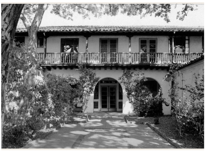
The Roth Building at 300 Homer Avenue, designed by Birge Clark in 1932, is the planned home for the new Palo Alto History Museum.

The Museum will begin with Palo Alto today—a small city of 67,000—and its outsized impact on the world. Palo Alto's phenomenal story puts it at the intersection for the creative