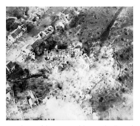
Aerial view of the remains of the French village of Vaux, pock-marked with shell craters.

The Army provided a pocket French phrase book and dictionary, but to small avail. My dad did actually learn some French and corresponded for a time with two youngsters from the village. He returned home on a German liner taken as reparation in 1918, a much more pleasant and rapid passage than journey over. He found a teaching position in Oklahoma and resumed his career in 1919.