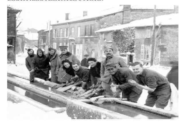
Washing in the trough at Vavincourt, France.

My father's group was billeted with French families in the village of Vavincourt, and he made friends with some of the residents. Conditions in rural France were rather primitive: they washed up and did laundry in the village's common trough. Nevertheless, they enjoyed a certain camaraderie with evenings of celebrations, music, and wine in a barn which served as a recreationall. A sign on one of the village shops admonished: "Please speak English - we don't understand American French!"