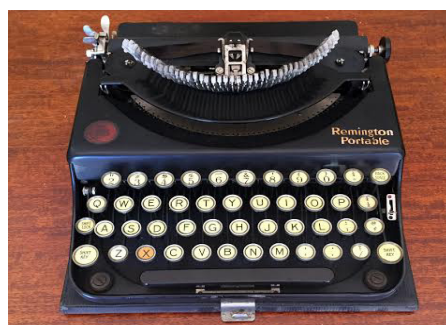
Remington portable typewriter