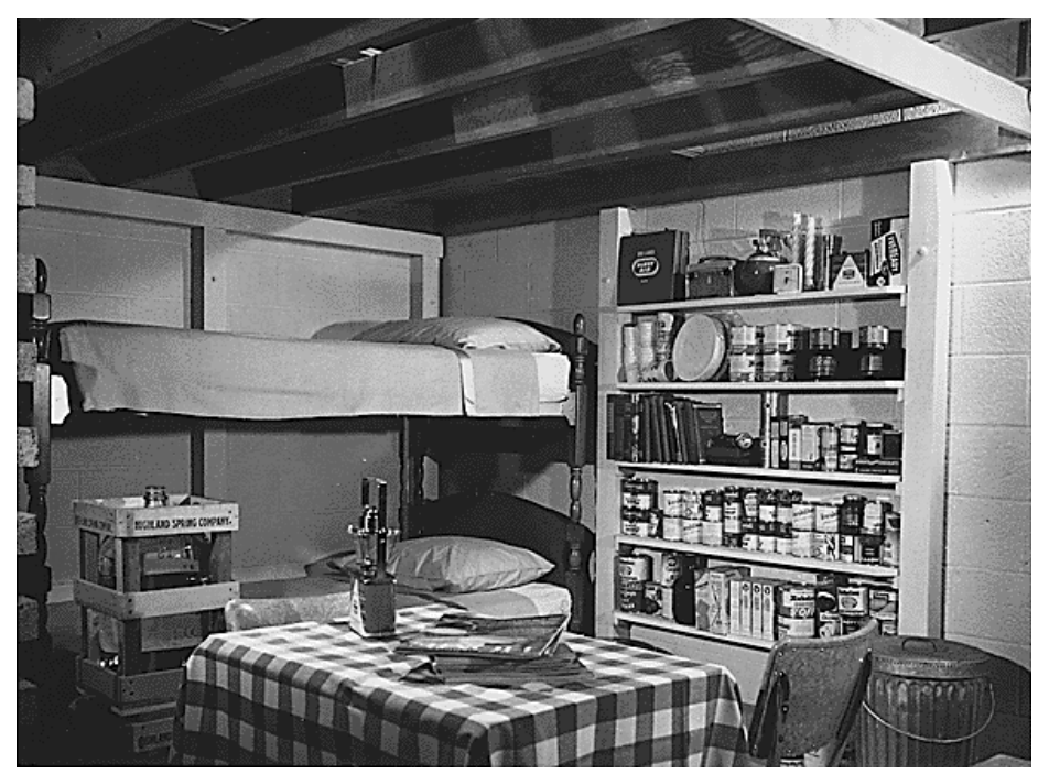
Idealized Fallout Shelter of the 1950s