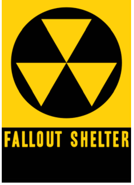
Fallout Shelter Sign

Today, fallout shelters are not in demand. With more powerful nuclear weapons and our location in Silicon Valley, a likely prime target of any attack, the need for a backyard shelter may be moot. Many sit abandoned in backyards; however, owners of some shelters have found new uses for their Cold War relics: transforming a shelter into a wine cellar is a not uncommon re-use in today's Silicon Valley.