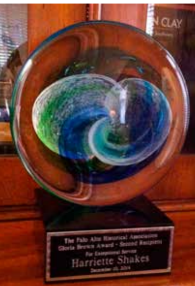
The Gloria Brown Award