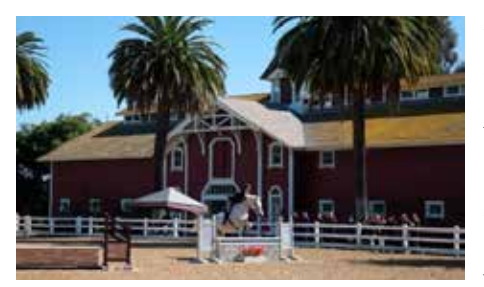
Equestrians at Stanford Red Barn

building located between the Stanford Shopping Center and the Medical Center. While the building was a cow barn for a brief time, it was built as a winery for Leland Stanford's vineyards on his Palo Alto farm (including the lands that today house the Stanford Shopping Center}.