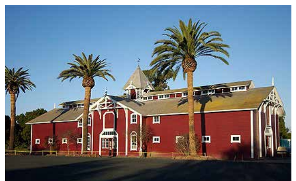
Stanford Red Barn

Stanford Red Barn