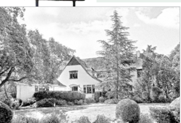
Stanford House Tour [ILLUSTRATION: SUNNY SCOTT]

Unless otherwise noted, images reproduced in the Tall Tree are from the PALO ALTO HISTORICAL ASSOCIATION archives.