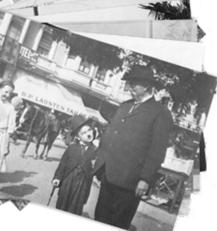
Set of PAHA archive images shown as postcards.