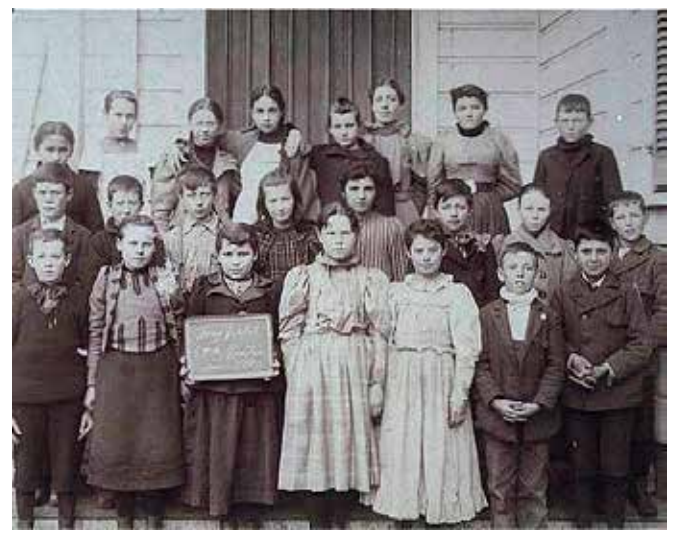
Sixth grade students pose for a class picture, taken in 1897, in front of the Mayfield School built in 1867.

Barron Park until 1948 and parts of South Palo Alto into the early 1950s, as well as "Mayfield" until 1966. It later became the Continuation High School until razed in the 1970s.