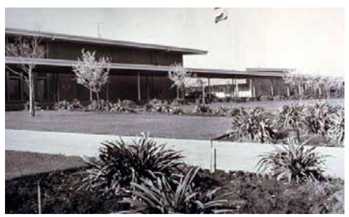
Cubberley Community Center, Room H-5, is the new home of the Archives.