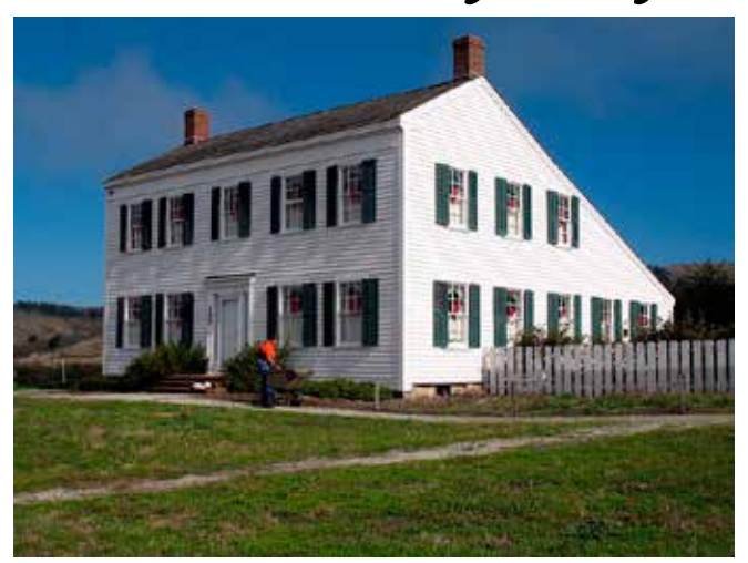
The White House of Half Moon Bay