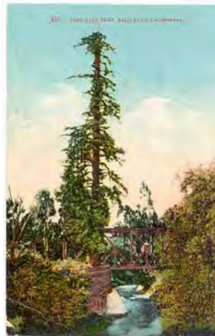
El Palo Alto shown on a 1904 postcard