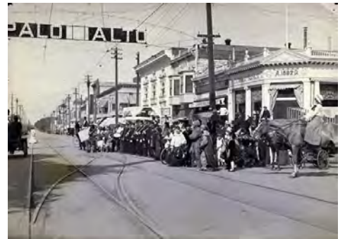
University Avenue parade 1912