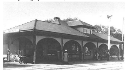
Palo Alto Train Station 1912