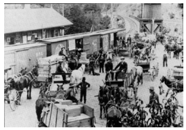
1893 photo of apricots being loaded at Wright's Station

Looking for the book? The Last of Prune Pickers: A Pre-Silicon Valley Story is available in paperback from 2Timothy Publishing (2010), ASIN: 098423912X, at http://www.2timothypublishing.com/ and through Amazon.com.