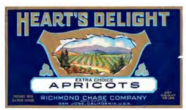
Poster advertising Santa Clara Valley apricots.