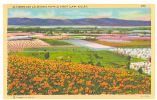
"Blossoms and California Poppies," 1930s vintage postcard of Santa Clara Valley