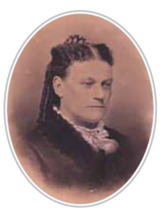
Photograph of Juana Briones (courtesy of Archives, Point Reyes National Seashore).