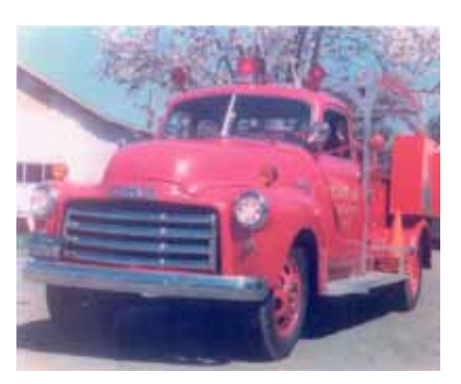
1951 GMC High-Pressure Pumper.

Chet Slinger, the first Fire Chief, supervised the growth of the department, secured the leasing of the firehouse, equipped it with an alarm system, and