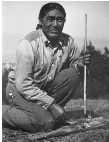
Ishi in 1914; demonstrating making fire (Wikipedia)