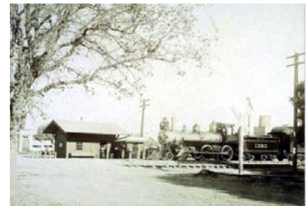
University Avenue train depot, 1895