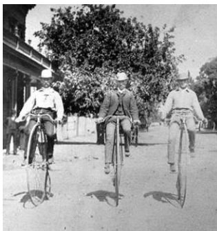
High-wheeler bicyclists in Mayfield, c. 1888

The first safety bicycles were expensive. The heavy machines were made of expensive machined parts, but soon prices began to drop as certain makers adopted the manufacturing processes of the assembly line and mass-produced inexpensive parts that Henry Ford would adopt some years later. The lower cost of the mass-produced bicycle permitted students and others of modest means to purchase the latest in this new technology.