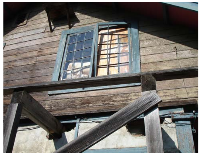
Recent photo of Briones house showing how house is left open to the elements.