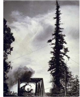
Train passing El Palo Alto, 1951