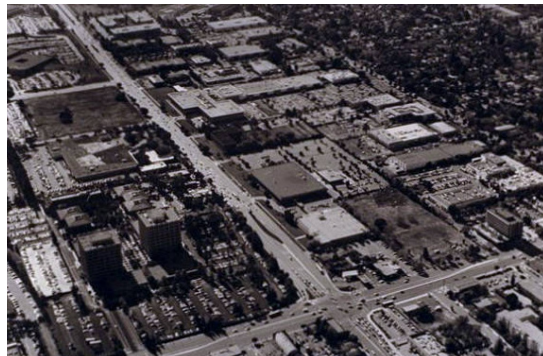
1985 aerial view of Stanford Research Park, home of some Silicon Valley companies today.