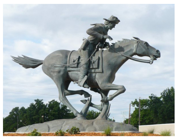
Memorial to the Pony Express riders

In June, 1860, Congress authorized a federal subsidy to construct a transcontinental telegraph to connect the western frontier states with California. As construction progressed— eastward from the Pacific coast and westward from Missouri—the Pony Express continued carrying the mail for the entire route; however,