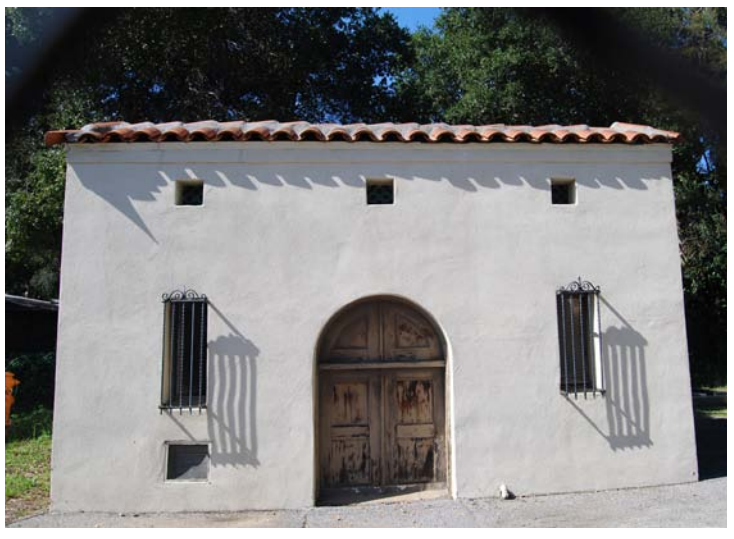
Hale Street Pumping Station

A little incongruous, you say, to combine preservation awards with a talk on utilities? Why, not at all! Several PAST members have noted the charm of the Hale Street Pumping Station (located at the end of Hale at Palo Alto Avenue), and have expressed dismay