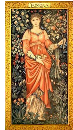
Pomona, goddess of fruits and orchards