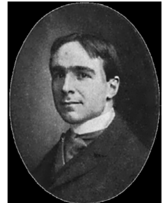
Winston Churchill (the author)