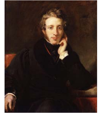
Sir Edward Bulwer-Lytton