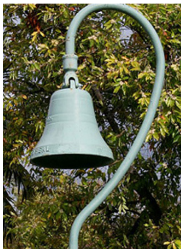
Commemorative El Camino Bell

OUR NEWSLETTER TAKES ITS NAME FROM THE VERY TALL TREE WHERE the