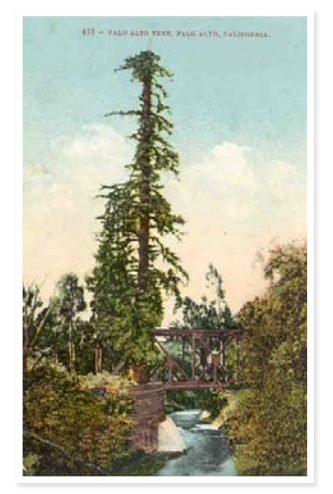
Tall Tree postcard acquired on eBay.