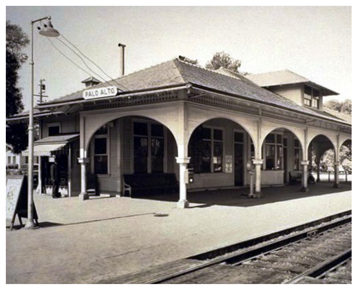
Palo Alto depot in 1930s, complete with shoeshine stand.