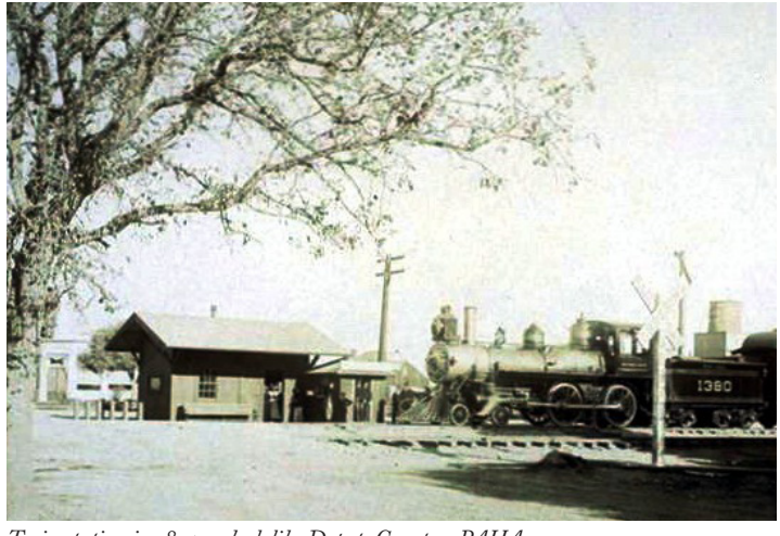
Train station in 1895, a shed-like Depot.