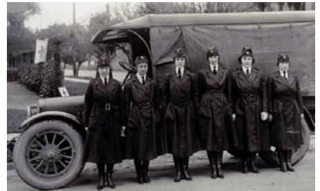
Six uniformed Palo Alto Red Cross Chapter workers, 1918.

In the time before anyone had heard of Leland Stanford