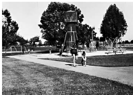
Greer Park, without circus tent.