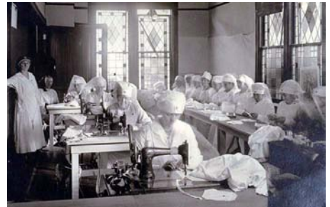
Palo Alto Red Cross workers, 1917.