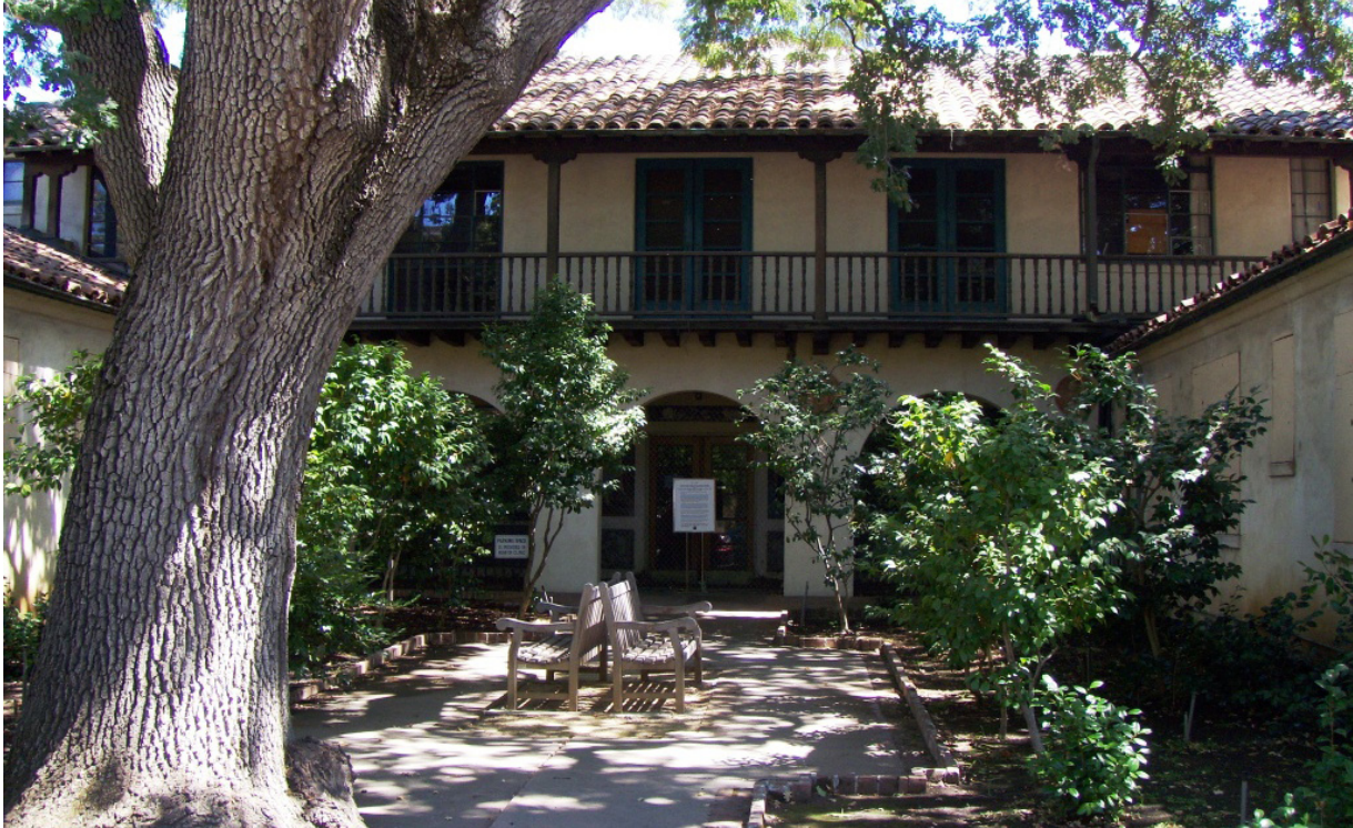
Photograph of Birge Clark's Roth Building, original home of Palo Alto Medical Foundation.