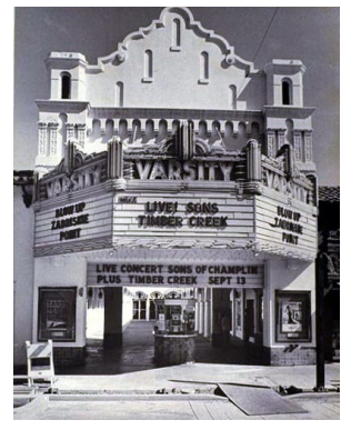
The movie theater on University Avenue that preceded Borders Books