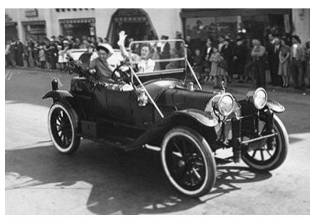
Vintage automobile in the 1941 Dedication Day parade, University Avenue, Palo Alto.

vidual oak trees. In those early days, horses, buggies, and drivers maneuvered around trees that grew in the middle of streets or alongside the avenues. Horses instinctively went around, but suddenly car collisions with trees became common. A dentist from Oakland won his suit against the town of Palo Alto for damage to his automobile when it collided with a tree. Most trees in the middle of streets were subsequently removed, and even trees at the side were threatened. There was a movement in the early teens to