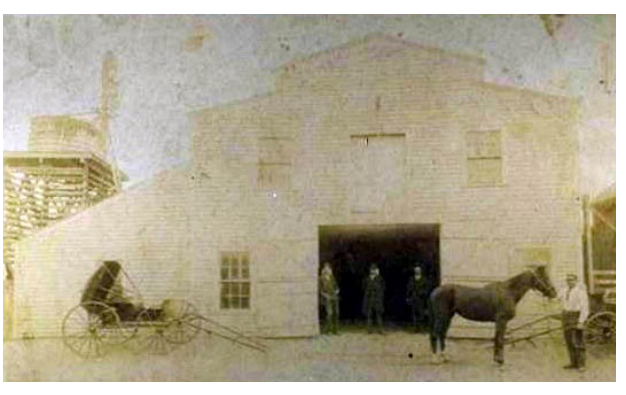
Jaspar Paulsen closed his livery stable on Forest Avenue in the early 1920's, but then sold and traded horses.

cut down all street trees. Fortunately, many were saved by having a coat of white paint applied to make them more visible.