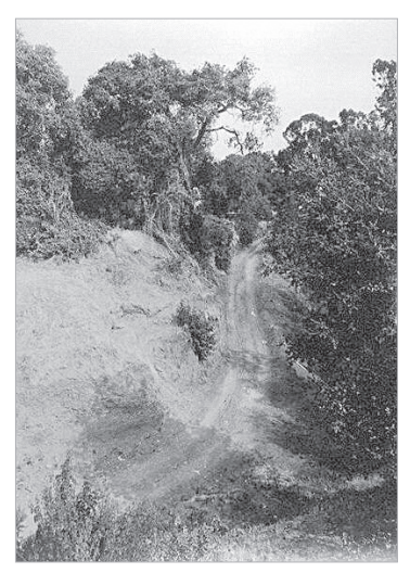
Can you hear the moo? Middlefield Road in its rural days.

Palo Alto's history is rich in innovation, advocacy, ingenuity, environmental leadership, diversity, architectural landmarks,