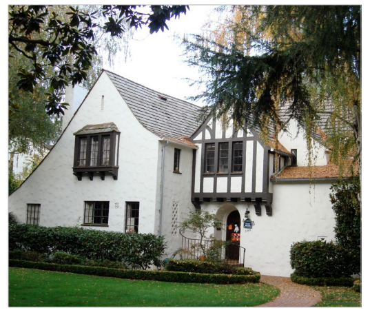
One of the Sumner houses to be toured.

of four of his signature homes in the Stanford San Juan district. The PAST tour this year will be in Crescent Park, each house a scenic stroll from the other, and with light refreshments along the way.