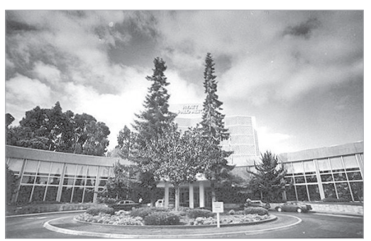
Which room of the Cabaña (Hyatt) Hotel was "infested" with Beatles during the 1960s?