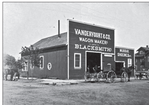
Corner of Hamilton and Emerson in 1907, not so different from auto repair shops that would come relatively soon.