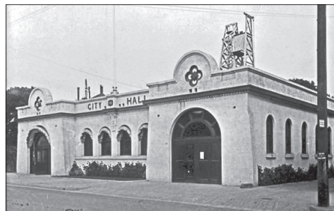
Palo Alto's tasteful City Hall on Ramona Avenue, 1907.