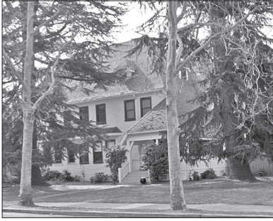
A Bakewell & Brown designed home on the Stanford Historic House Tour, April 29.

"Restoration and Renovation" is the theme for the Stanford Historic House Tour on Sunday, April 29, 1 - 4. The tour opens five vintage campus houses and their gardens and benefits the work of the Stanford Historical Society.