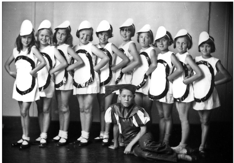
Dancers in Almost Nine , produced by Children's Theatre in 1934.